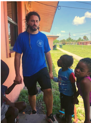
Dunbar, Ft Myers FL